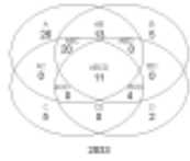
Figure 2. Venn diagram of over-represented terms. The Venn diagram shows the number of GO terms considered significantly over-represented ( p -value \leq 0.01 ) by the Fisher Exact Test using four different probability cutoffs \mathbb{P}(\text{gene}_j \text{ is periodic}) \geq A, B, C \text{ or } D \Rightarrow \text{periodic} : A = 0.70 , B = 0.95 , C = 0.99 and D = 0.9999 .

because it directly takes into account the uncertainty in the data instead of introducing a discretization step (Figure 1).